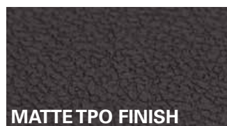
MATTE TPO FINISH