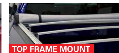
TOP FRAME MOUNT