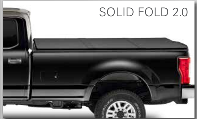
SOLID FOLD 2.0