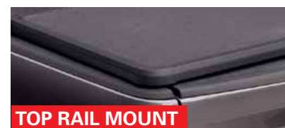
TOP RAIL MOUNT