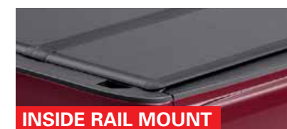
INSIDE RAIL MOUNT